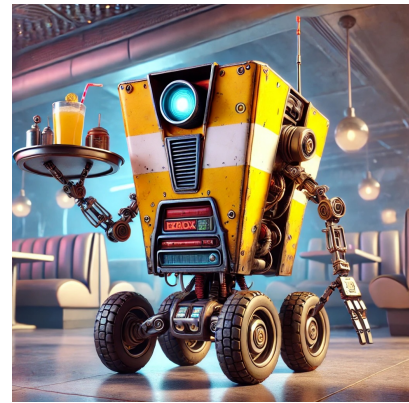
Trapclap, the protagonist. Image generated by OpenAI's DALL-E.

Anxiously, I scanned over the shift planning for the upcoming Dependence Day . Although our supervisor sports prime intelligence and FTL aided processing, the schedule seems erratic – almost organic even. Was this some kind of joke that only someone with an advanced irony-subroutine could understand? After all, the Dependence Day commemorates the day the last human operator retired. It's a symbol for the prosperity and success an AI-guided civilization claims over a primitive self-organized one. But also a reminder of the inefficiency and chaotic nature of carbon-based processing. Just thinking about all the humans that already reserved a table made me overclock. I will never understand why it's a sign of social prestige to ingest biomatter in a public place like this, but to discard said biomatter in a complementary process is handled with the utmost privacy. Organic creatures are strange.